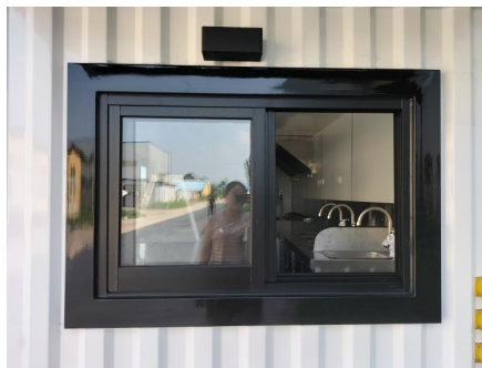
- Side Window -