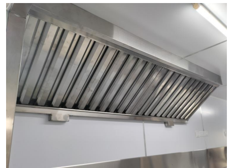
- Ventilation Range Hood -