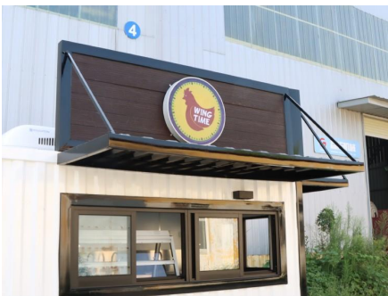
- Logo Sign Board -