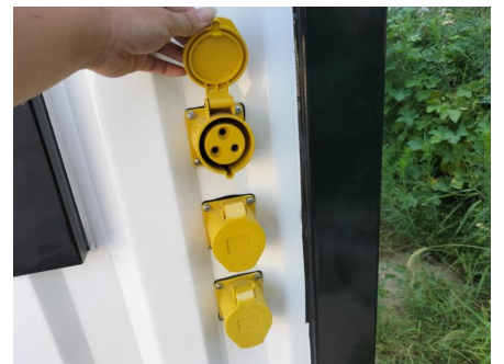
- Generator Receptacles -