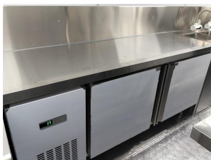
- Refrigeration -