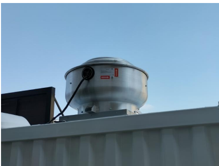
- Roof Ventilation Fan -