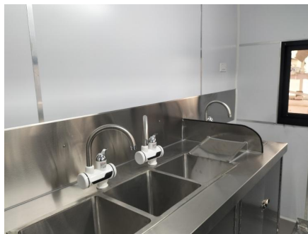
- Water Sink -