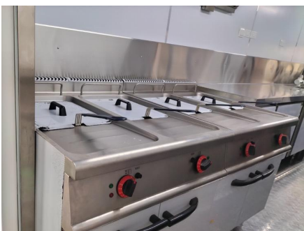
- Fryers -