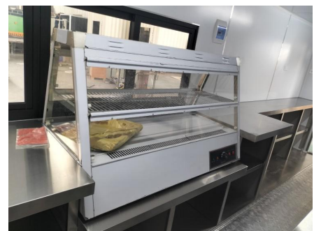
- Food Warmer -